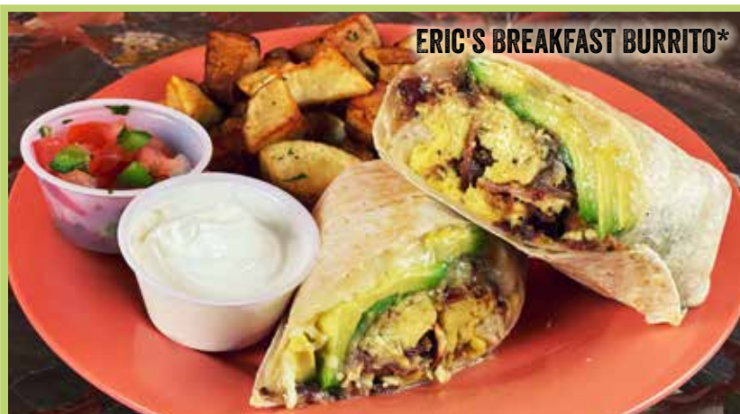
ERIC'S BREAKFAST BURRITO*