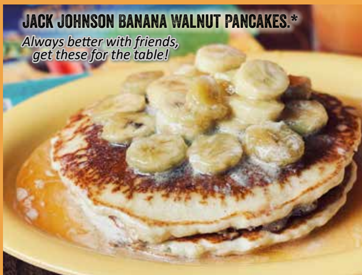
JACK JOHNSON BANANA WALNUT PANCAKES.*

Always better with friends, get these for the table!