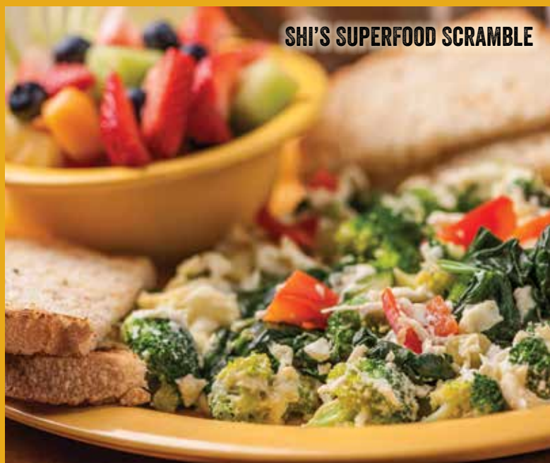
SHI'S SUPERFOOD SCRAMBLE

Pro Tip: ADD PESTO AND TURKEY SAUSAGE – 4.99