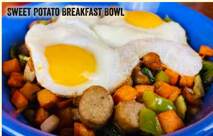
SWEET POTATO BREAKFAST BOWL

Sweet bowl, bro! Sweet potatoes, green onions, zucchini, green bell peppers, spinach and your choice of protein and topped with 2 eggs any style – 16.49