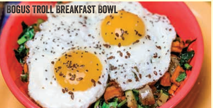
BOGUS TROLL BREAKFAST BOWL

Sweet bowl, bro! Sweet potatoes, green onions, zucchini, green bell peppers, spinach and your choice of protein, topped with two eggs any style and a sprinkle of our flax & chia seed blend – 15.49 (Cals: 550, Fat: 23g, Protein: 33g, Carb: 58g) MACROS CALCULATED WITH TURKEY SAUSAGE