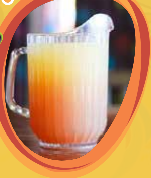
BLUEBERRY LEMONADE MIMOSA