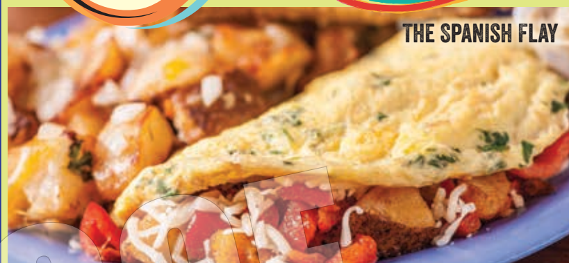
THE SPANISH FLAY