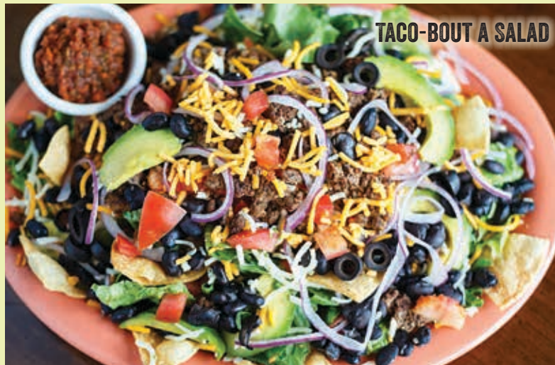
TACO-BOUT A SALAD

Be the taco the town... Homemade tortilla chips topped with refried or black beans, shredded Jack and cheddar cheese, fresh-cut romaine lettuce, your choice of protein, avocado, tomatoes, housemade pico de gallo, olives and red onions, served with our homemade red salsa on the side - 14.49