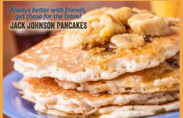
Always better with friends, get these for the table! JACK JOHNSON PANCAKES