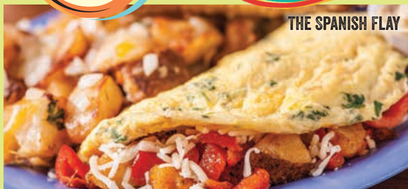
THE SPANISH FLAY