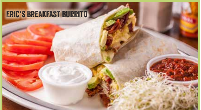
ERIC'S BREAKFAST BURRITO