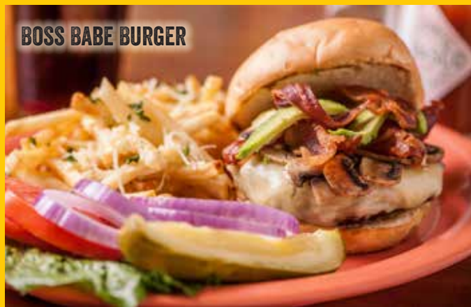
BOSS BABE BURGER

Cheers to every boss babe! A seasoned grilled hamburger topped with Swiss cheese, crispy bacon, sautéed mushrooms and avocado, served with romaine lettuce, fresh-cut tomatoes, sliced red onions and pickle chips. French fries, our special burger sauce and a pickle spear on the side – 16.49