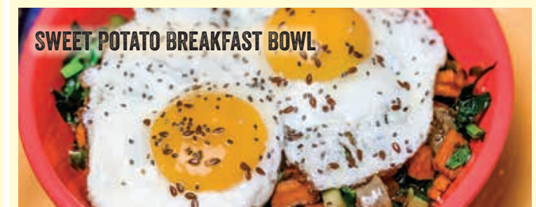
SWEET POTATO BREAKFAST BOWL