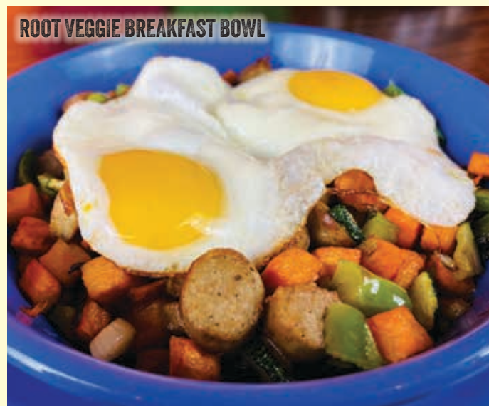
ROOT VEGGIE BREAKFAST BOWL

Rooting for you, one bite at a time! Root vegetable hash, green onions, zucchini, green bell peppers, spinach and your choice of protein and topped with 2 eggs any style – 17.49