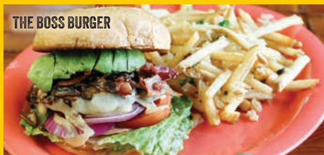
THE BOSS BURGER

PRO TIP: KEEP IT ON THE SUNNY SIDE AND ADD A FRIED EGG – 2.49