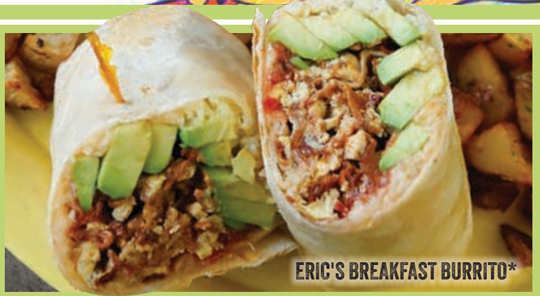
ERIC'S BREAKFAST BURRITO*