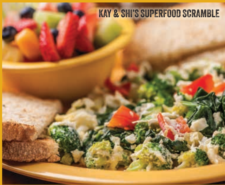
KAY & SHI'S SUPERFOOD SCRAMBLE

PRO TIP: ADD PESTO AND TURKEY SAUSAGE – 4.99