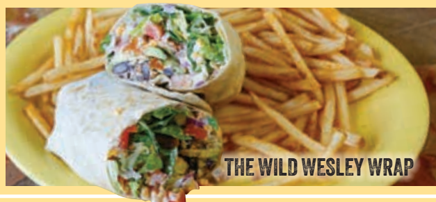
THE WILD WESLEY WRAP

The best of the southwest...Grilled chicken breast, black beans, shredded Jack & cheddar cheese, fresh-cut romaine lettuce, avocado, tomatoes, homemade pico de gallo and red onions wrapped in a jumbo flour tortilla. Served with a side of fries – 16.99